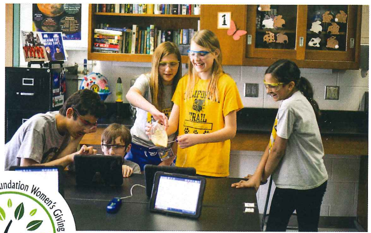
The Spring 2016 cycle of the Women's Giving Circle, was a $10,000 grant to fund "Fostering Bilingual Literacy." It is a program at Westview Elementary School to initiate a Bilingual Book Buddies Club so that students, who primarily spoke Spanish in the home, can read together with their parents.