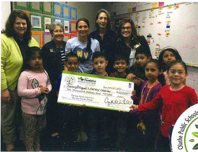
Students at California Trail enjoying science projects due to a $10,000 grant from the OPSF Women's Giving Circle Fall, 2015 campaign.